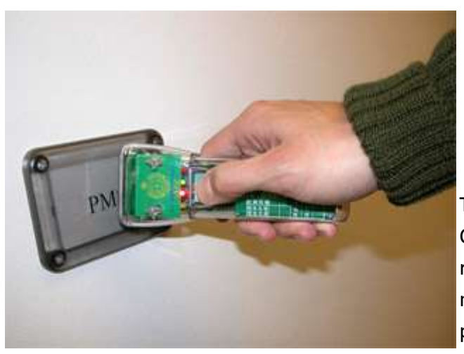
To enhance efficiency, the Hong Kong Correctional Services Department is replacing the mechanical patrol management system with this smart card patrol management system.

This monitoring system involves a lot of manual work, from replacing records cards (particularly difficult in inclement weathers for those recorders located outdoor), visual checking and counter-checking of all record cards to storage.