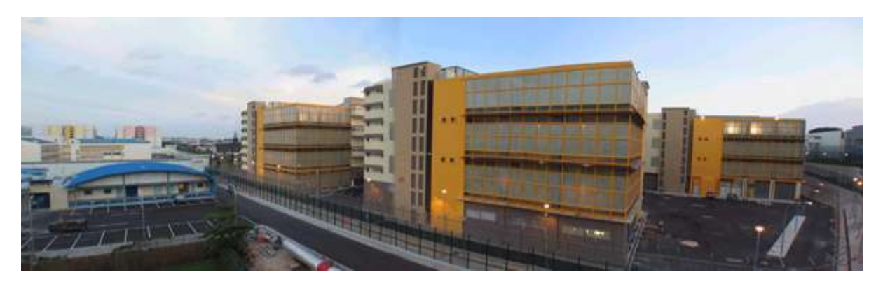
Cluster A with the Transit Centre (with its blue roof) on the left.

'Making a Social Impact: Breaking the Offending Cycle'