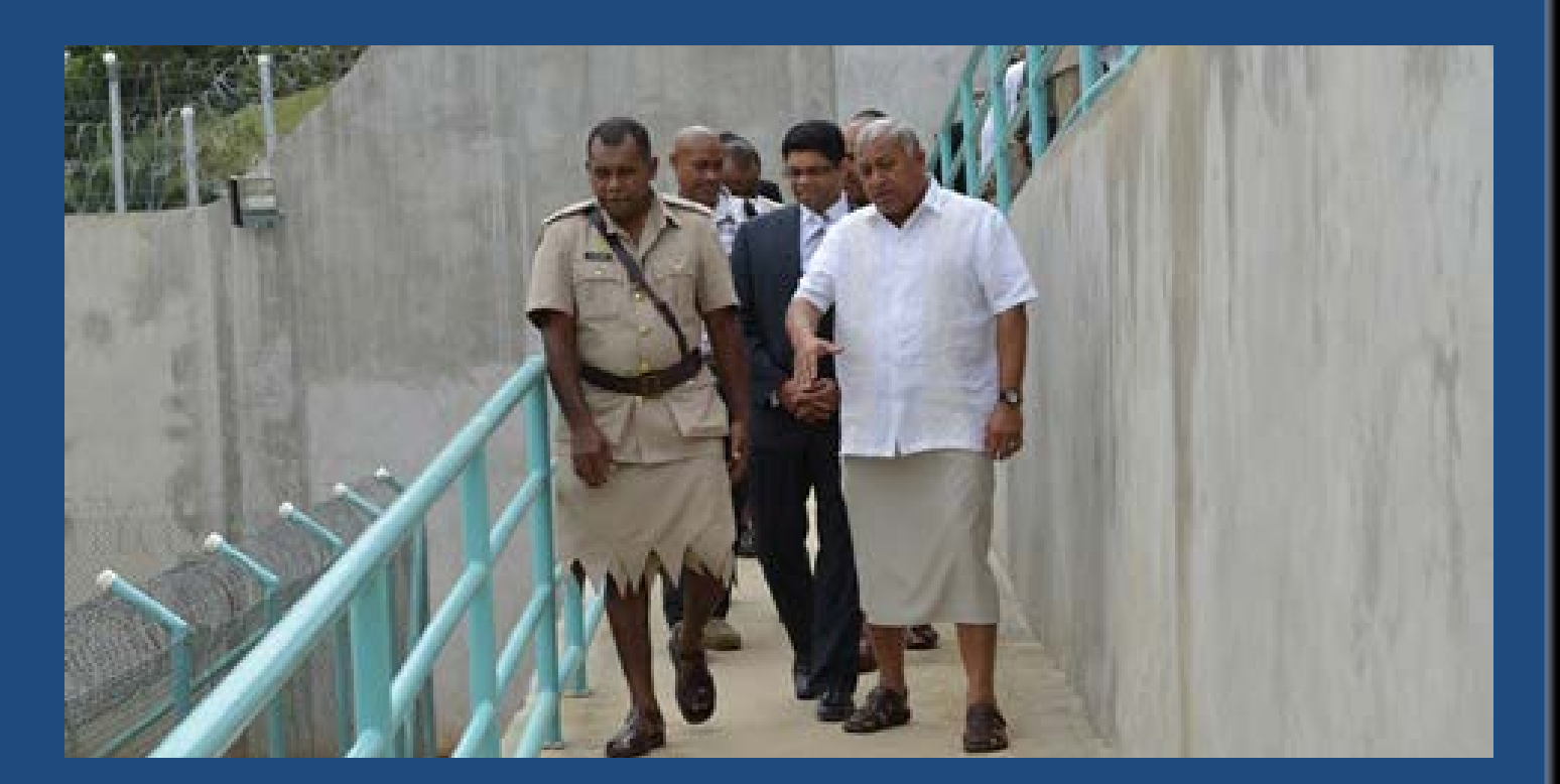
Fiji's Prime Minister Commodore Voreqe Bainimarama is being taken on a tour of the new $11.6m Suva Remand Centre by the officer-in-charge Savenaca Baleiwai.