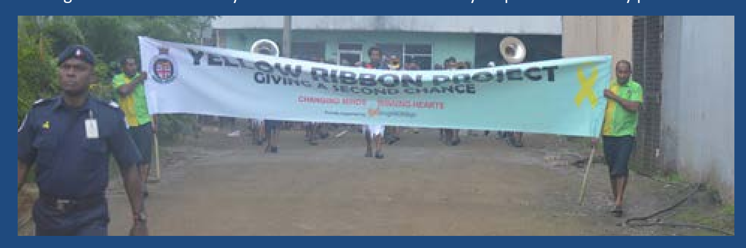
Officers of the Fiji Corrections Service lead a march during a recent Yellow Ribbon launch in the province of Tailevu.

We recently launched the programme in Tailevu, a province which has the most number of offenders admitted and the community response was a very positive one.