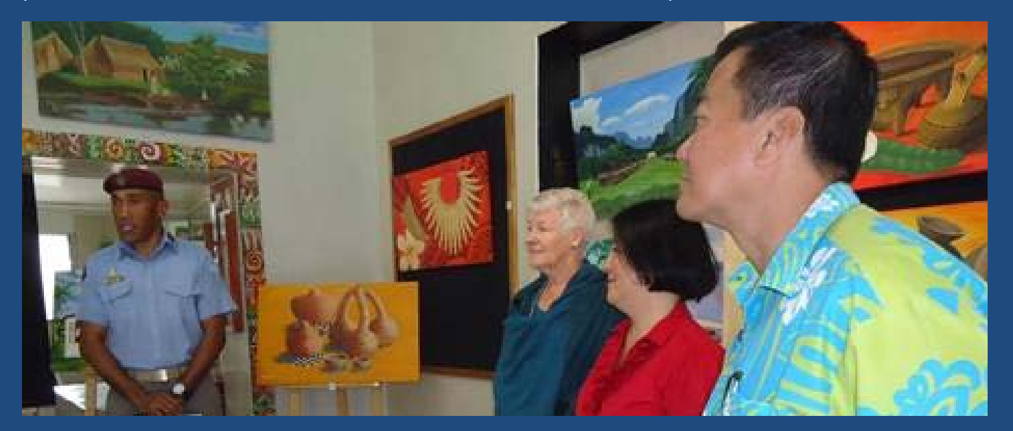
Guests at a recent arts exhibition at the Fiji Corrections Service's Tagimoucia Gallery in Suva.

Its' objective, among others, is to mobilise and facilitate the community to take action toward rendering appropriate support services to help ex-offenders.