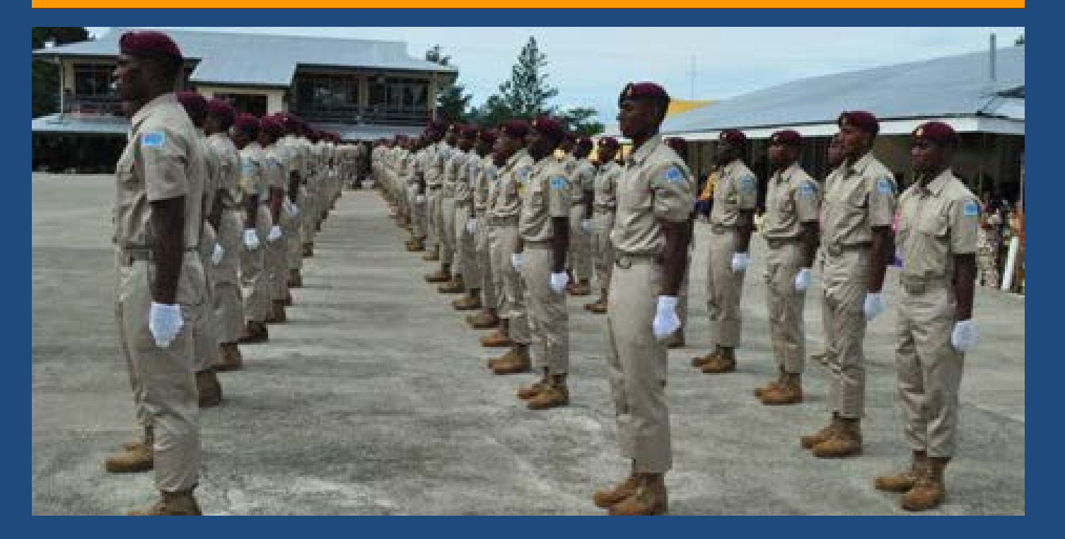
New Fiji Correction Service recruits during a recent pass-out parade.