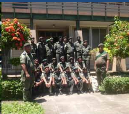
CSSI HQ staff