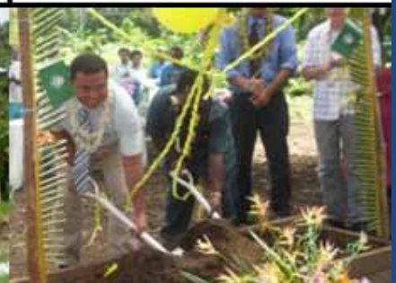
Lata Correctional Centre Staff Housing Development Project 2011 Opening of Lata Staff Houses 8 June 2012