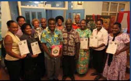
CSSI Staff recognised with Gender Audit