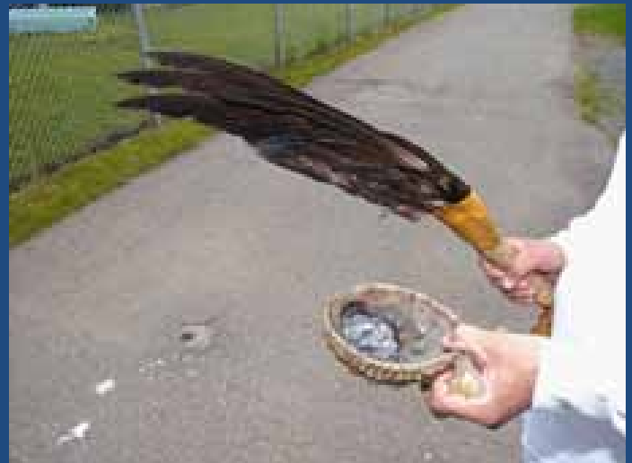
Smudge bowl and eagle feather

Since the early 1990s, CSC has taken several key measures to facilitate effective corrections and produce positive correctional results for