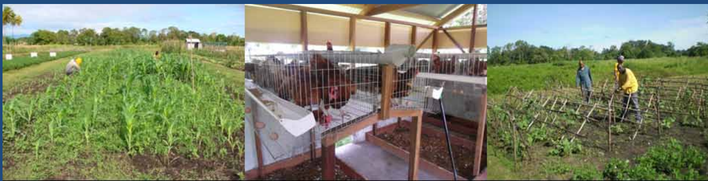
Prisoners actively engaged in farm management and production skills