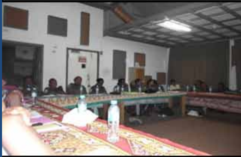
CSSI Women's Network Workshop May 2012