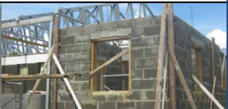
Lata Correctional Centre Upgrade 2012