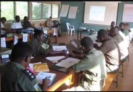
Recruits Graduations June 2012 including participant from Nauru and Vanuatu