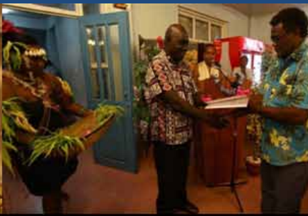
Gender Audit Report launched