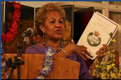
RAMSI Gender Specialist