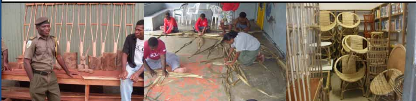
Prisoners upskilled with knowledge from Solomon Islands College of Higher Education