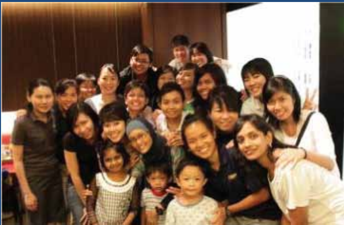
The all-girl outing. Ok, and a couple of boys.

“Managing women inmates is not necessarily an easy task.”