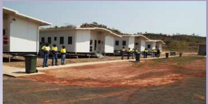
Increasing community work projects

One program available is the newly created Community Work Crew, which consists of an NTCS supervisor and up to 10 offenders. The crew, equipped with its own trailer and tools, can conduct a range of projects of benefit to the community including landscaping, minor maintenance and gardening.