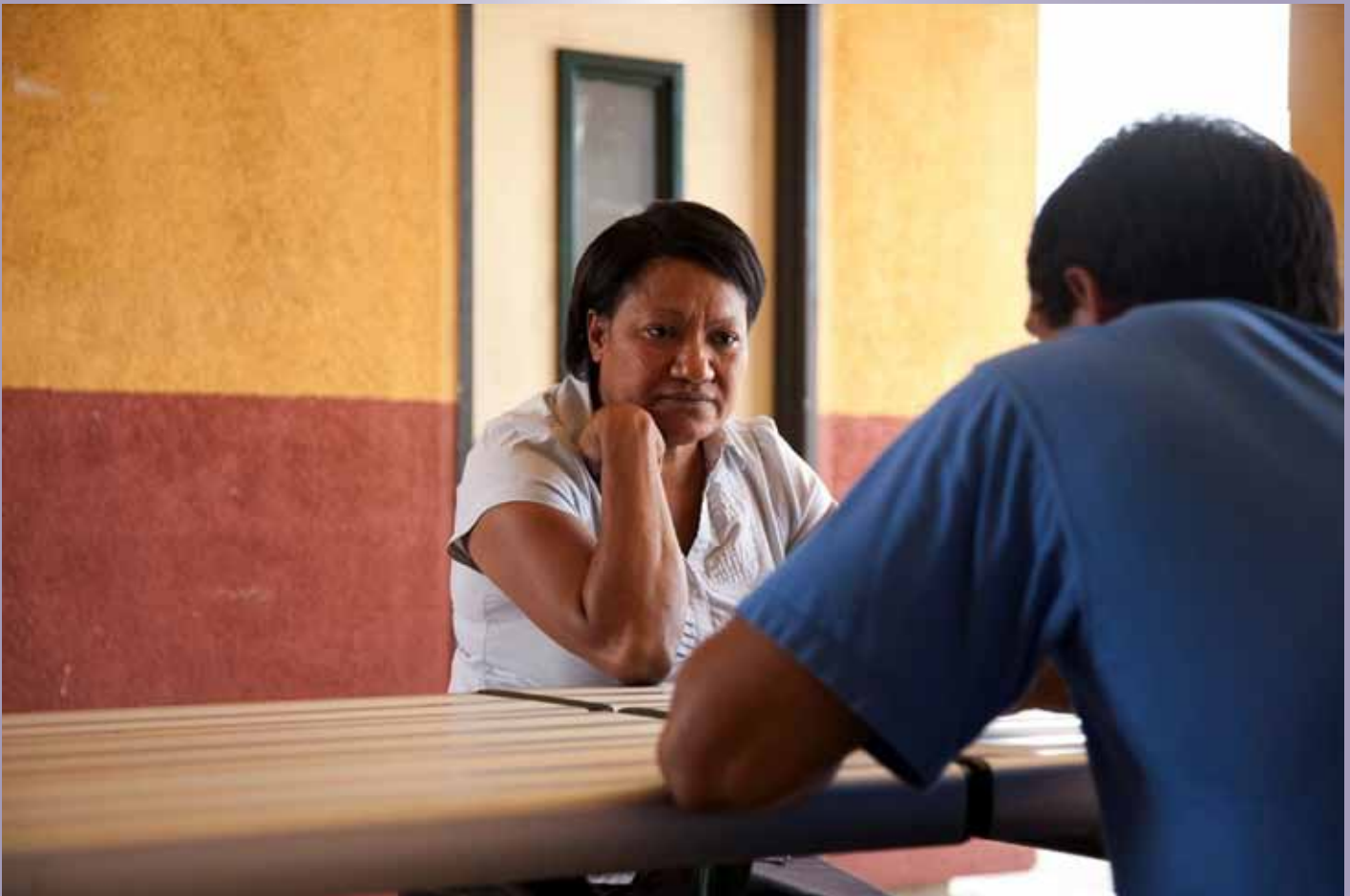
Links back to family and community is key for reintegration

“Around 82 percent of inmates are Indigenous and so require a unique approach to reintegration back into the community which is both culturally sensitive and safe.”