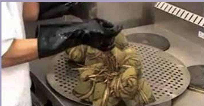
A rehabilitated person employed by the social enterprise cooks rice dumplings

Since August 2008, HKCS has lined up the cooperation of a catering operator (Ocean Empire International Ltd.) and a non-government organization [the Society of Rehabilitation and Crime Prevention, Hong Kong (SRACP)] for the establishment of a social enterprise to provide employment opportunities for rehabilitated offenders. The tripartite partnership project, known as "Rice Dumpling Production Project", is supported by a grant of HK $1.4 million (US $0.18 million) under the Enhancing Self-Reliance Through District Partnership Programme run by the Hong Kong Government.