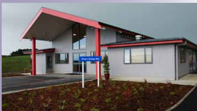
Whare Oranga Ake are a new approach to successfully re-integrating prisoners back into the community.

Corrections opened two new reintegration units, called Whare Oranga Ake, in July 2011 and prisoners are settling in well to their new environment.