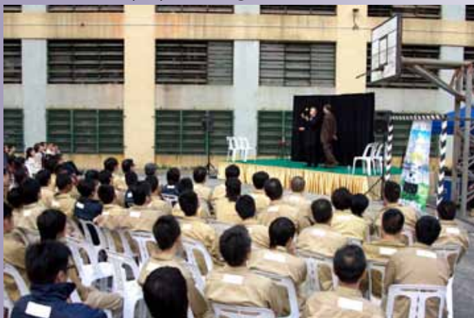
Inmates are attracted by the performance of the two French performers

With the approaching of St Valentine's Day, Macao Prison co-operated with a local NGO, Fuhong Society of Macau, and jointly launched the Valentine's gift sets for Valentine's Day, each Valentine's gift included heart-shaped cookies made by inmates of Macao Prison. The Fuhong Society of Macau is a local non-profit social service organization that provides comprehensive vocational rehabilitation services for adults with mild or moderate mental disabilities. The gift sets were sold to the public and the earned profit would be used as a rehabilitation service subsidy by that organization.