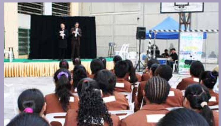
Alliance Francaise de Macao brings a cultural performance into Macao Prison expressing care to inmates

The performance took place in one of the recreation grounds of Male Detention Zone in Macao Prison. Approximately 100 inmates enjoyed the show. At the performance, two French performers transcended the language barrier using light and humorous music, magic and farce, and had an artistic and cultural exchange with the inmates. The wonderful performances gave inmates a joyous afternoon and enabled them to experience care and support from the community. Through participation in various educational activities, vocational trainings and interest classes in the prison, inmates learn diligently and reform themselves for future payback to society. With the acceptance and support from different social sectors, inmates can cultivate a stronger determination for self-reform, to rebuild their lives, and to obtain a successful reintegration into the society upon release.