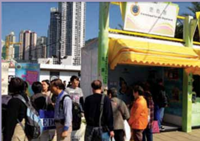
HKCS set up an exhibition booth at the 46 th Hong Kong Brands and Products Expo in December 2011 to promote public awareness of offender rehabilitation services. The 24-day Expo attracted an attendance of 2.52 million visitors