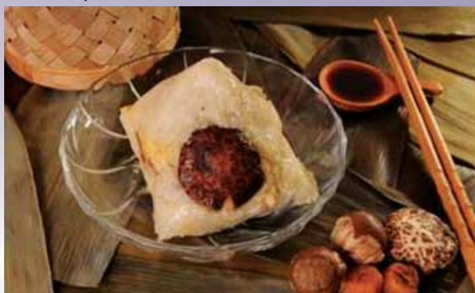
A rice dumpling made by a rehabilitated person working in the social enterprise

HKCS refers suitable inmates to undergo a series of vocational training under this project covering basic knowledge on food handling and production. Upon completion of the basic course, kitchen assistant placement is then offered by the social enterprise to suitable persons.