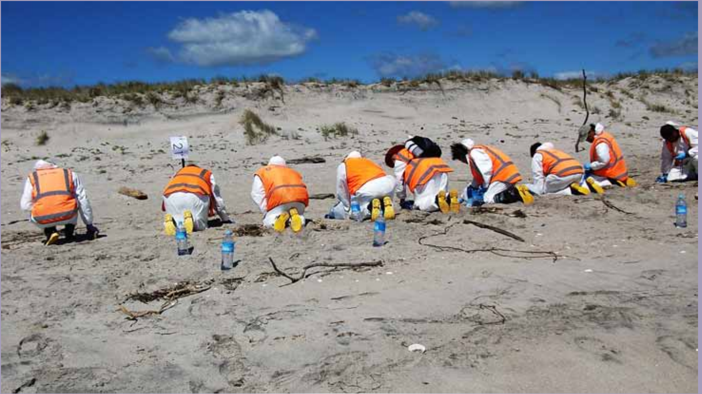
Offenders on Community Work beachcombing for oily waste.

Offenders on community work sentences worked alongside other members of the community to help clean up oil washed ashore from a grounded cargo ship, Rena , which ran aground in October 2011. Staff and offenders were deployed on beaches wherever they were needed and removed large quantities of the oily waste. On average 60 offenders initially worked daily for a period of five weeks and as required on an on-going basis.