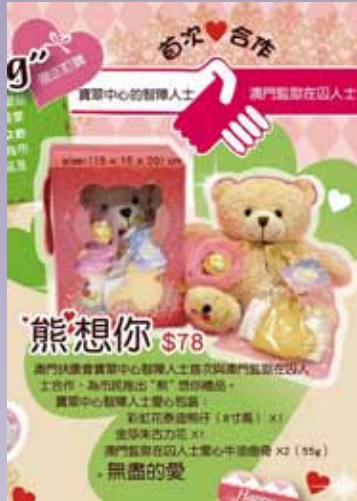
The Valentine's gift set

In addition, the Macao City Fringe Festival organized by Civic and Municipal Bureau was held in Macao recently. This festival is a showcase