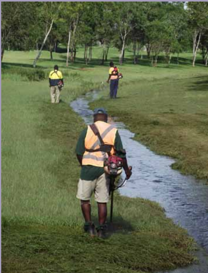
The Barkly Work Camp