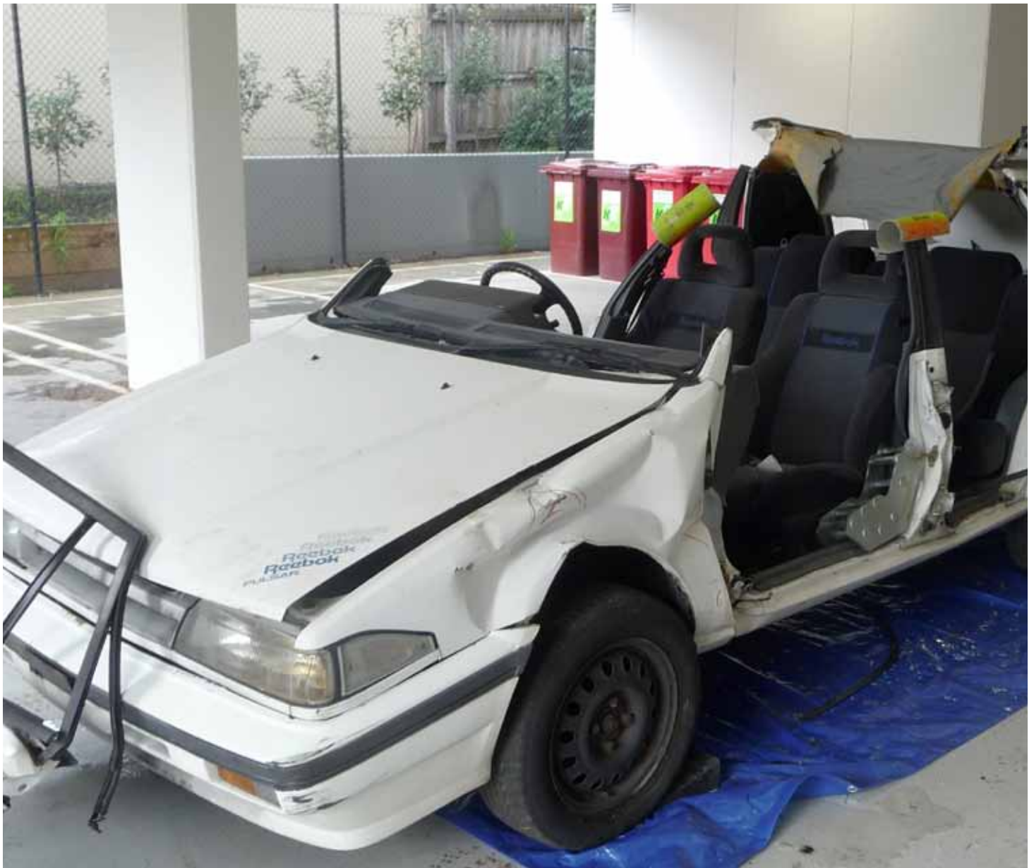
Demonstration of Country Fire Authority car-cut rescue included in the Stop Start Program for young offenders.

Vic indicates that road crashes are the biggest killer of young people aged 16-25. In their first year of driving, young people are three times more likely to be injured or killed than older, more experienced drivers. Young drivers are more at risk because they lack driving experience and engage in risky behaviour on the roads. The tendency to take risks is part of being a young person, but for too many young people on the road, this results in death or serious injury.