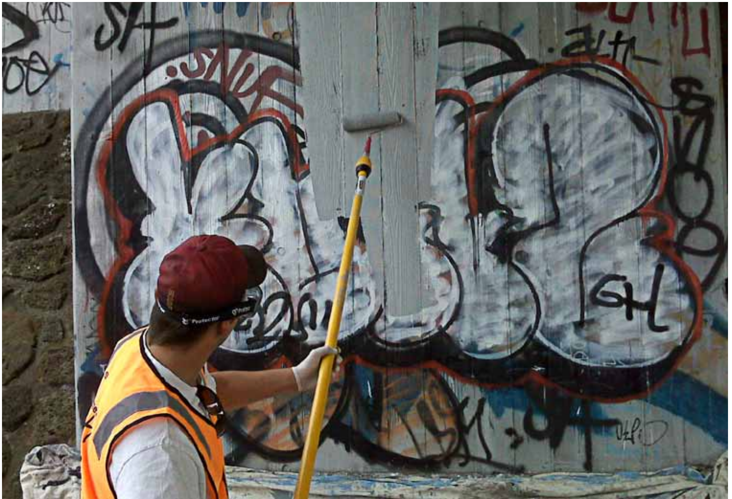
Offenders working on the Graffiti Removal Program

Services' State-wide Graffiti Removal Program (GRP) was established in November 2005 as a means to assist with the cleanup and beautification of metropolitan Melbourne prior to the 2006 Commonwealth Games. Due to the success of the program, it was expanded and extended until 2011, and preparations are currently underway to ensure its sustainability into the future.