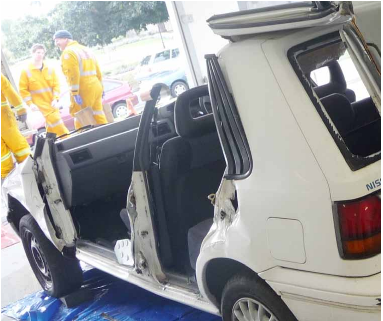
Demonstration of Country Fire Authority car-cut rescue included in the Stop Start Program for young offenders.

milestone achievement of having removed 720,011.1 square metres of graffiti from approximately 1,500 sites across Victoria. This work was carried out by approximately 13,500 offenders contributing over 254,000 hours of community work.