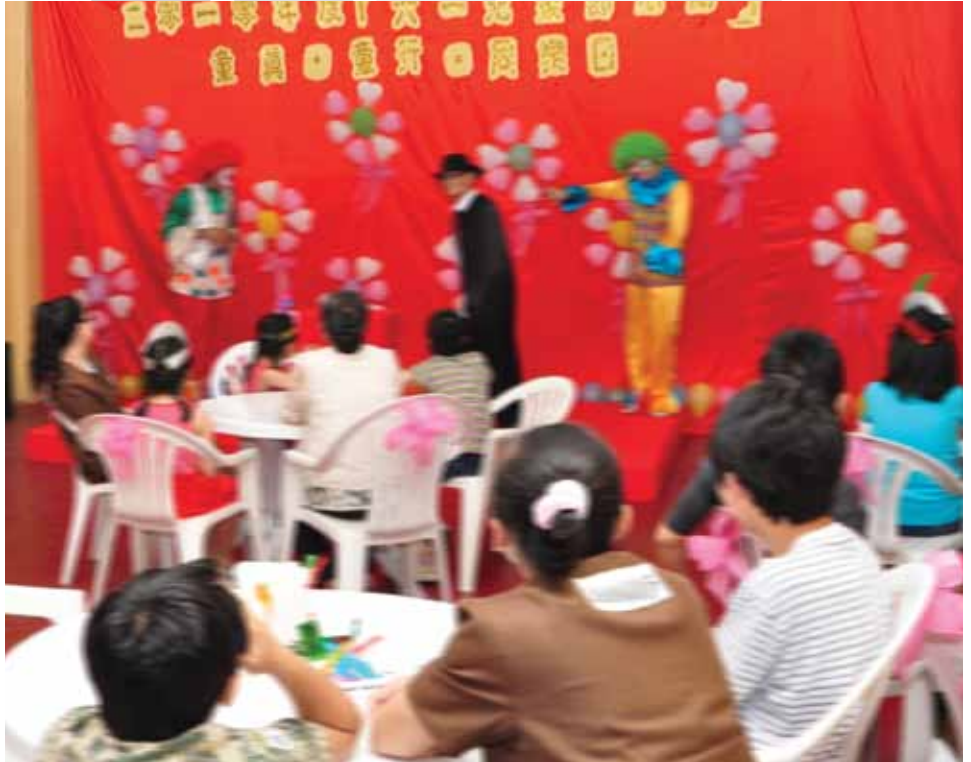
The clowns and the magician entertain the audience with their antics and tricks

The prison also arranged a series of programmes in the afternoon to fill the day with fun and enjoyment. First, clowns