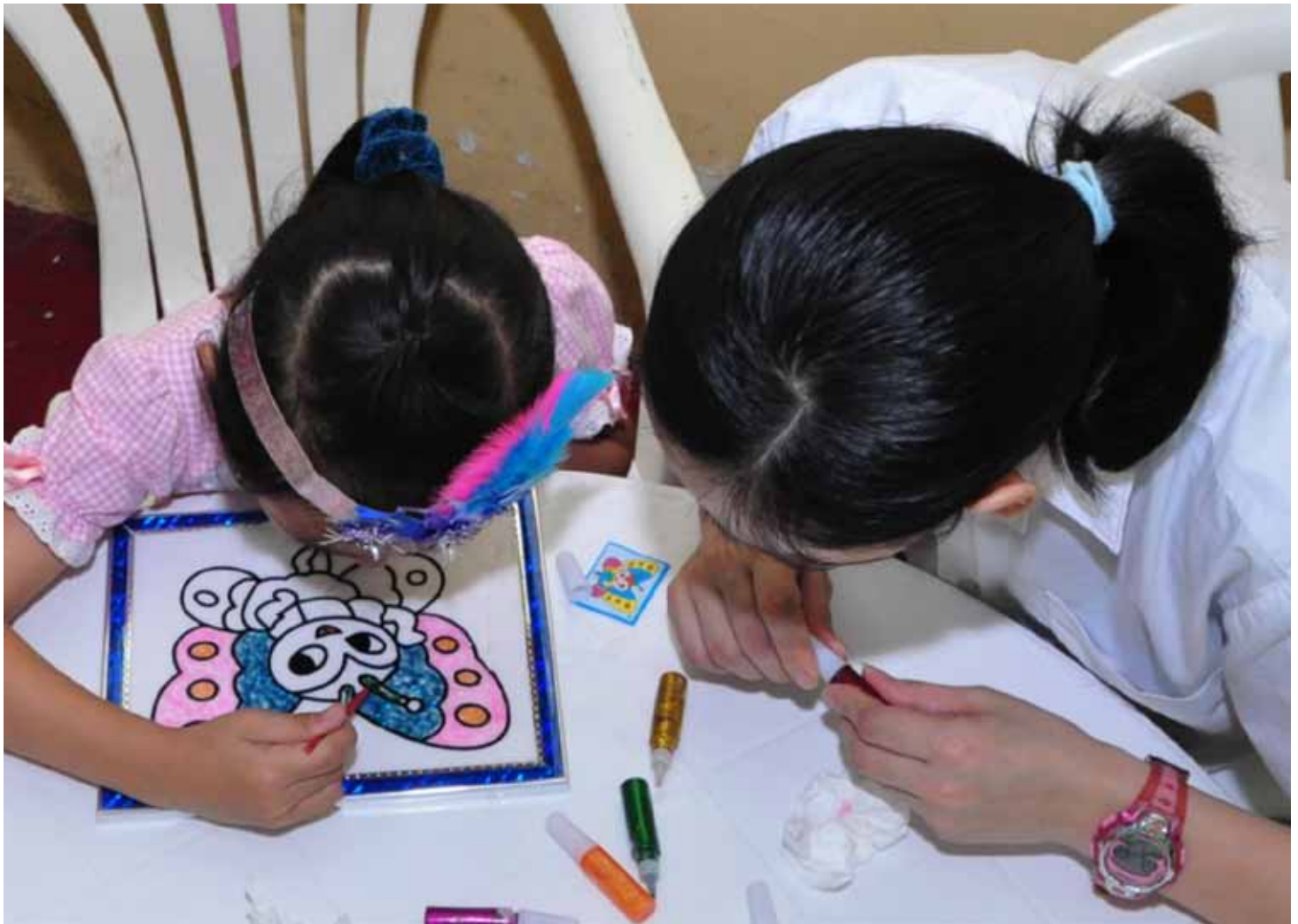
A female inmate engages in sand painting with her child

parent-child interaction between the inmates and their children and emphasized the important role that family support plays in helping inmates reintegrate into the community.