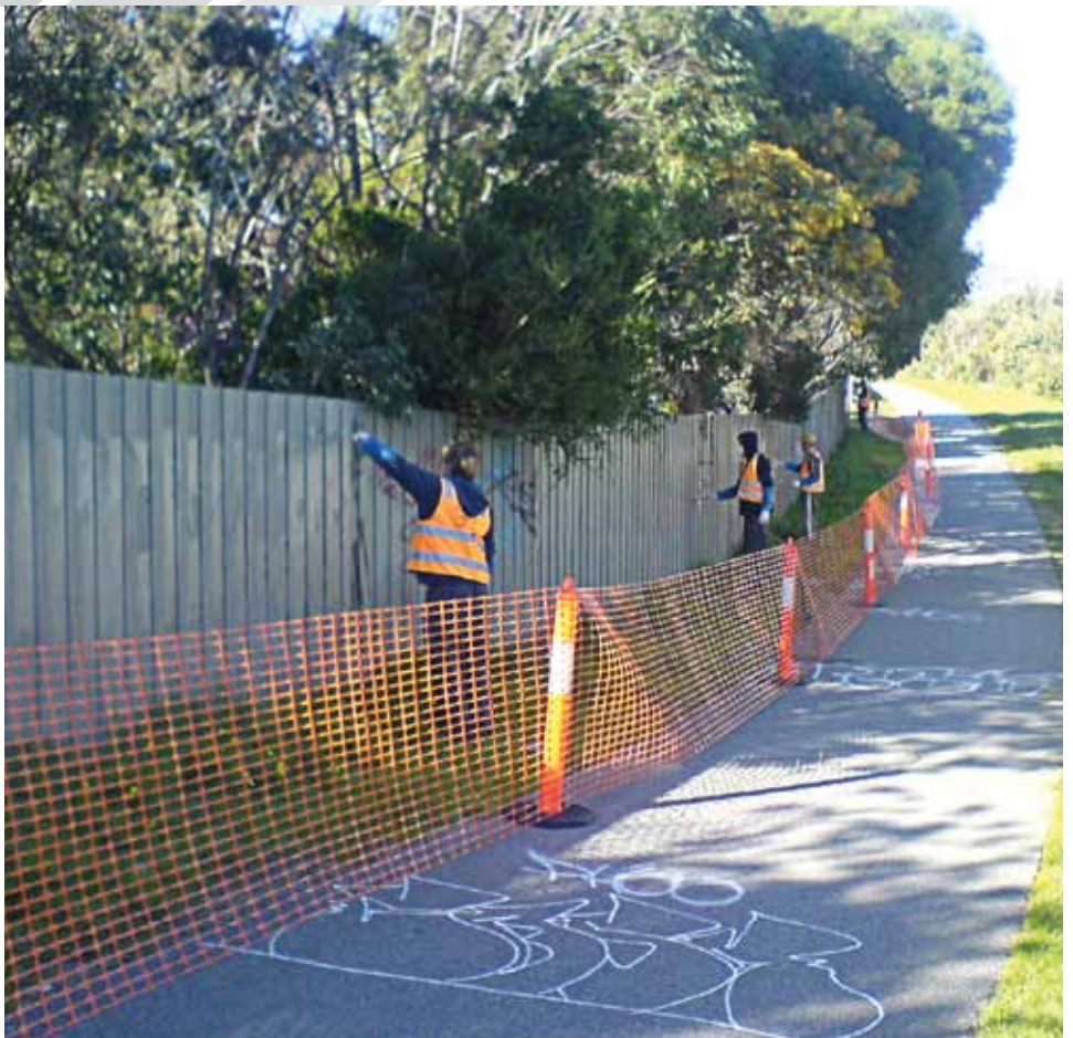
Offenders working on the Graffiti Removal Program

The role of Community Correctional Services is to manage and facilitate the successful completion of community-based supervision orders imposed by a court or the Adult Parole Board. This role includes developing partnerships with community organisations so as to enable offenders to undertake unpaid work that benefits the community.